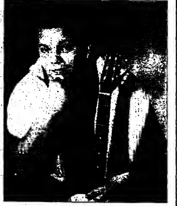
Bireli Lagrene plays in Jerusalem and Tel Aviv.